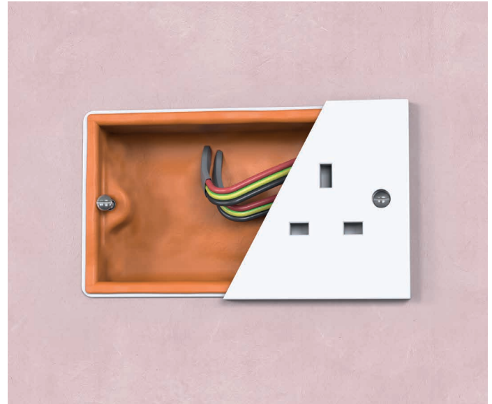
Double Socket Quelfire Intumescent & Acoustic Putty Pad installed