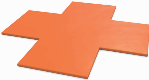
Single Socket Quelfire Intumescent & Acoustic Putty Pad

Quelfire Intumescent & Acoustic Putty Pads are designed to maintain the fire resistance of plasterboard partitions where they have been penetrated by plastic or metal electric socket boxes. They also make a significant contribution to the reduction of air leakage in properties, helping reduce energy costs and carbon emissions.