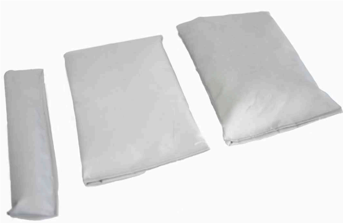
QFP QuelStop Intumescent Fire Pillows

QFP QuelStop Intumescent Fire Pillows help prevent the spread of fire through metal cable trunking systems that penetrate through fire compartment walls.