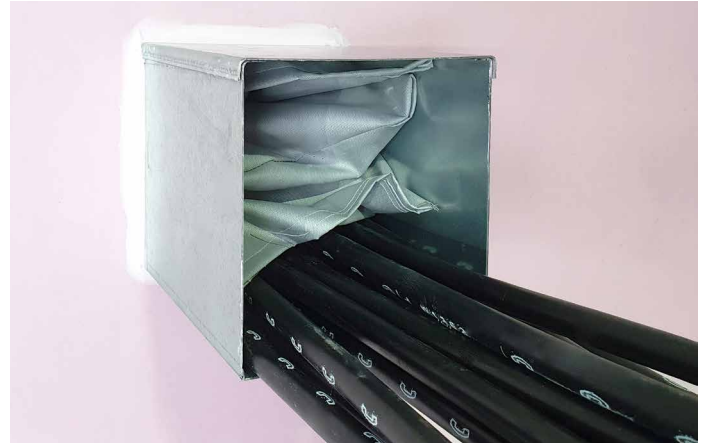
QFP QuelStop Intumescent Fire Pillows Installed in Steel Cable Trunking