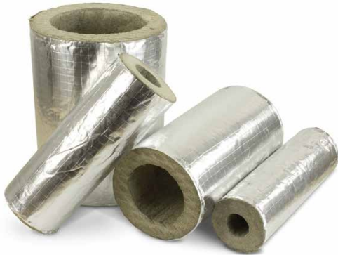
QIF Insulated Fire Sleeves

QIF Insulated Fire Sleeve prevents the spread of fire where combustible (plastic) and non-combustible (metal) pipes penetrate fire compartment walls and floors.